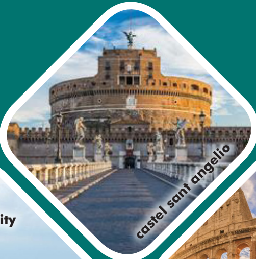
castel sant angelo