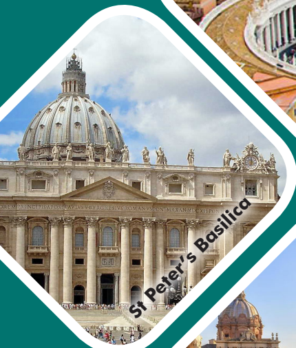
St Peter's Basilica