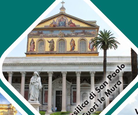
Basilica di San Paolo Fuori le Mura