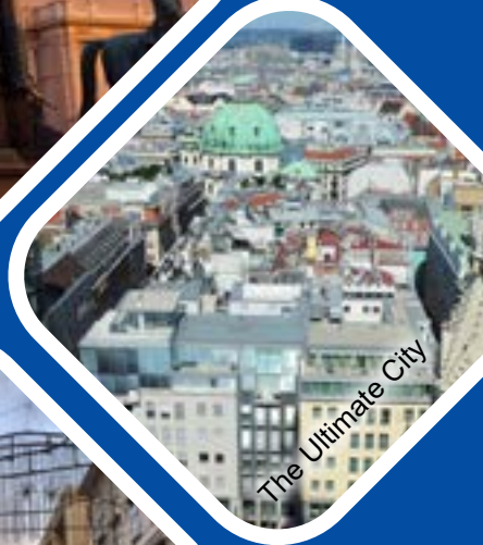
The Ultimate City