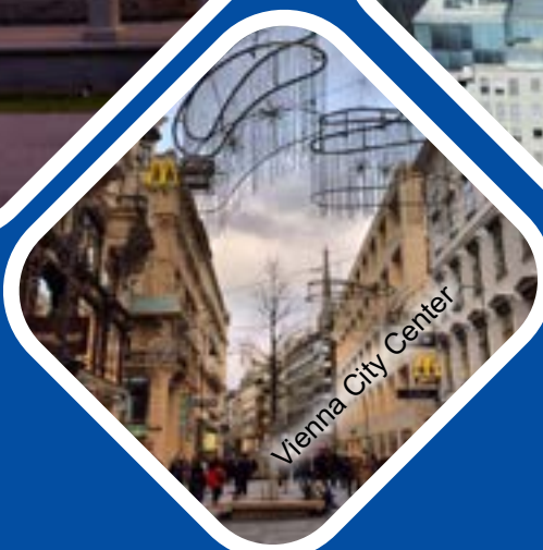
Vienna City Center