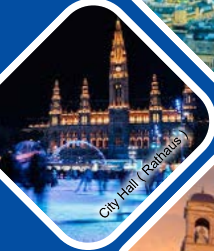
City Hall (Rathaus)