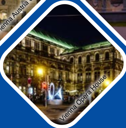
Vienna Opera House