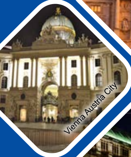
Vienna Austria City