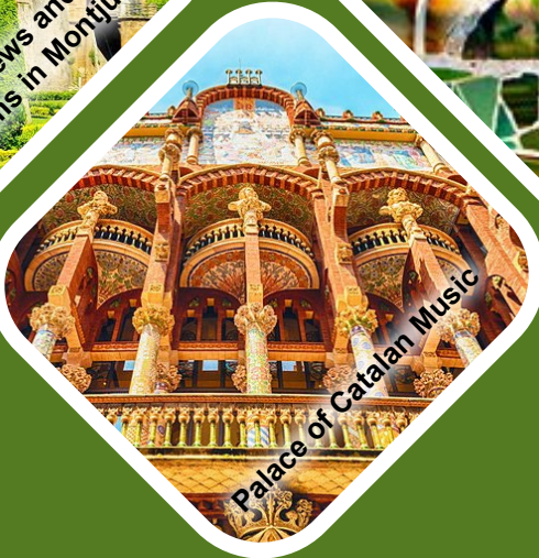
Palace of Catalan Music