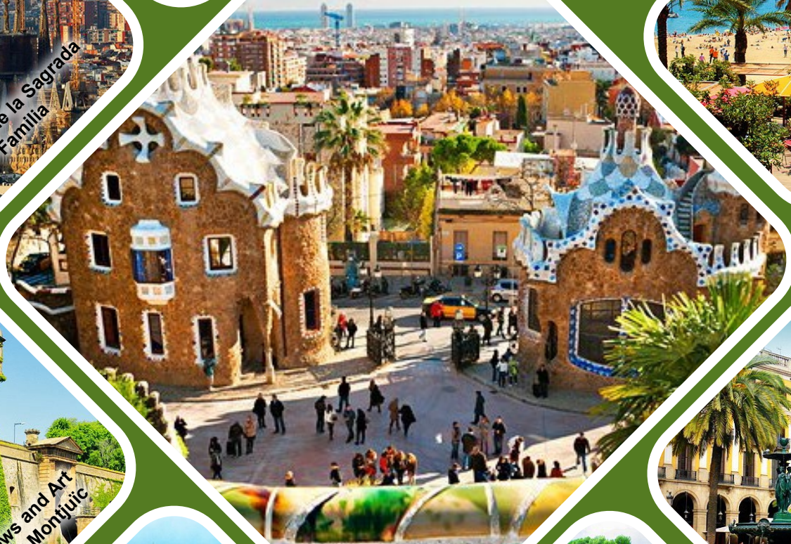
Gaudí's Surrealist Park