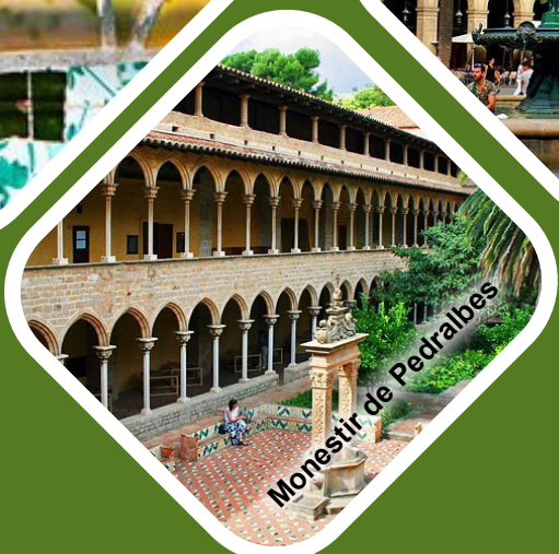
Monestir de Pedralbes