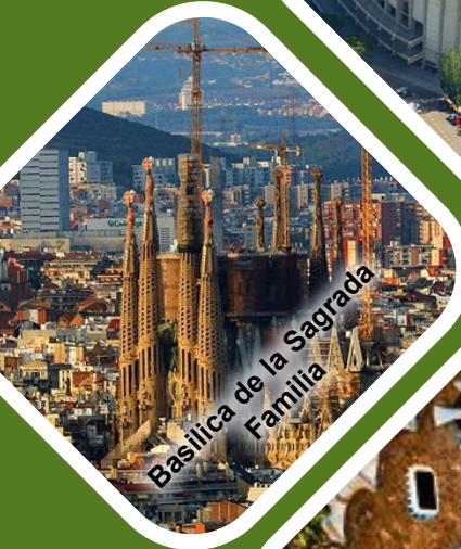
Basilica de la Sagrada Família