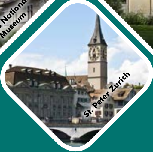
St. Peter Zurich