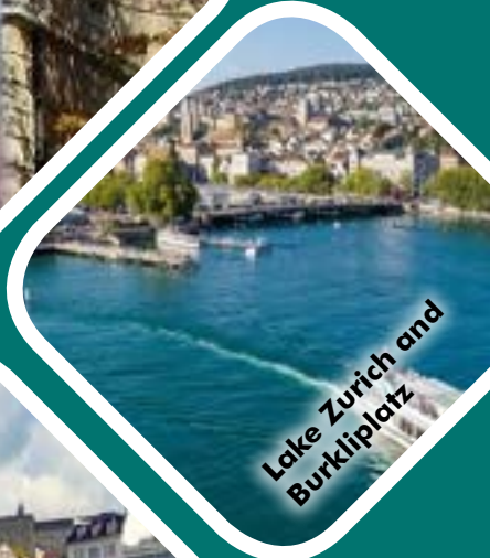
Lake Zurich and Burkliplatz