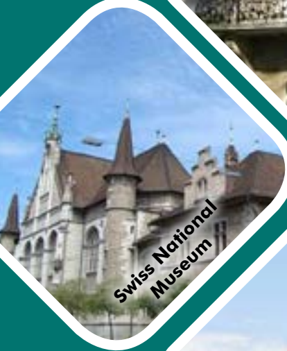
Swiss National Museum