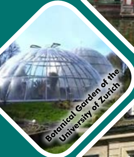
Botanical Garden of the University of Zurich