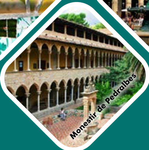
Monestir de Pedralbes