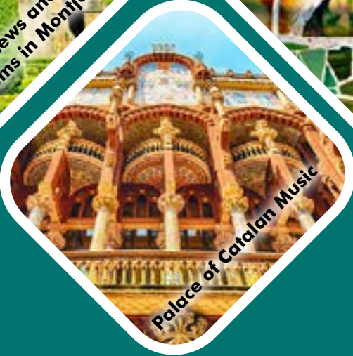
Palace of Catalan Music