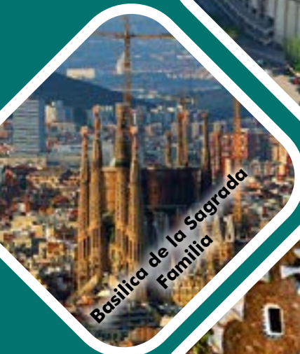
Basilica de la Sagrada Família