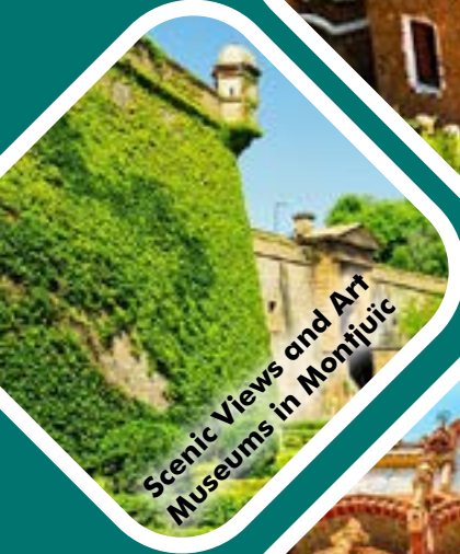
Scenic Views and Art Museums in Montjuïc