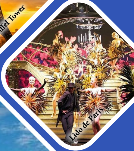
Lido de Paris