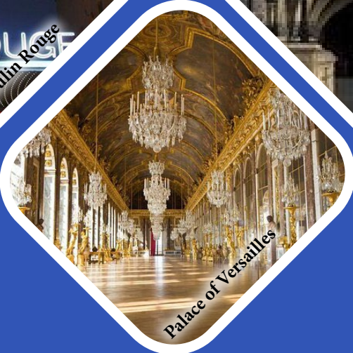
Palace of Versailles