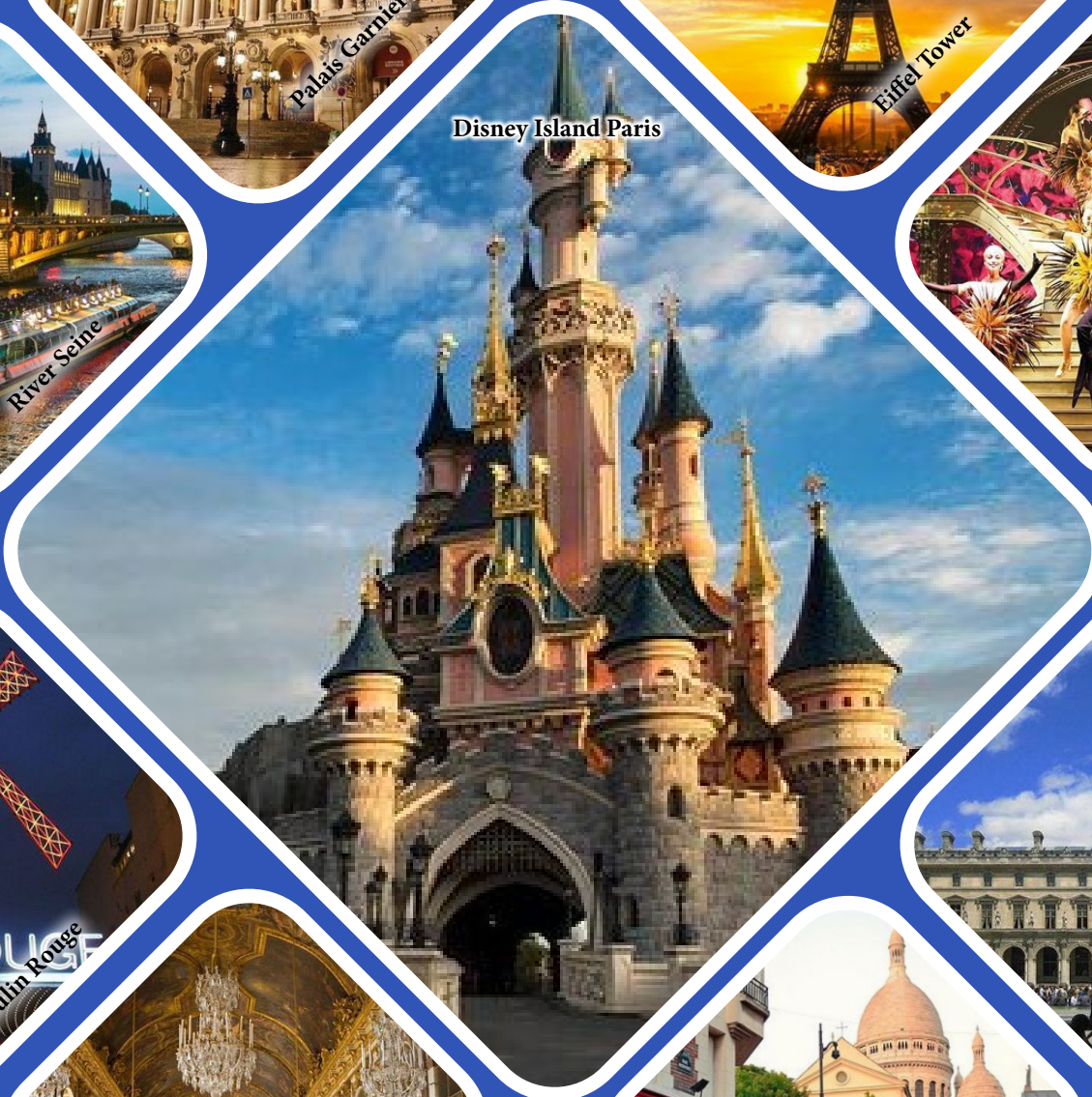
Disney Island Paris