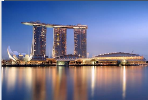
Marina Bay Sands