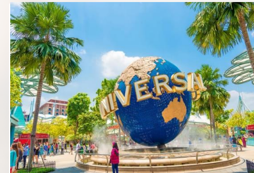
Universal Studios Singapore