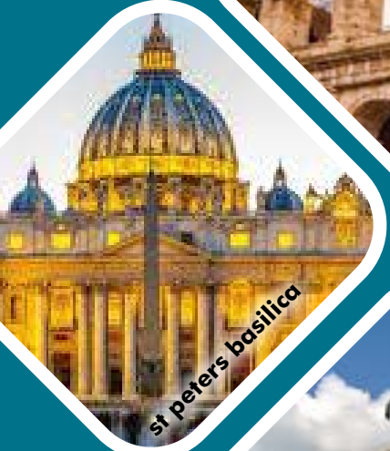
st peters basilica