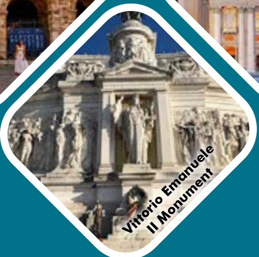
Vittorio Emanuele II Monument