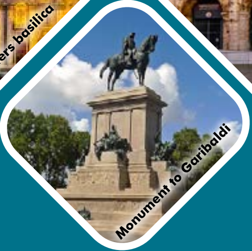
Monument to Garibaldi