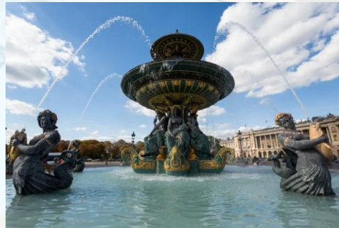
Place de la Concorde