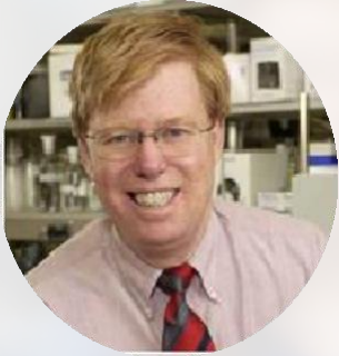
Moses Rodriguez College of Medicine Mayo Clinic, USA