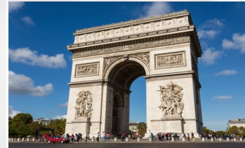
Arc de Triomphe