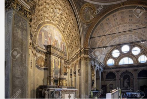
Santa Maria delle Grazie, Brescia