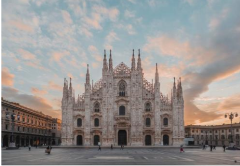
Il Duomo Milan Cathedral