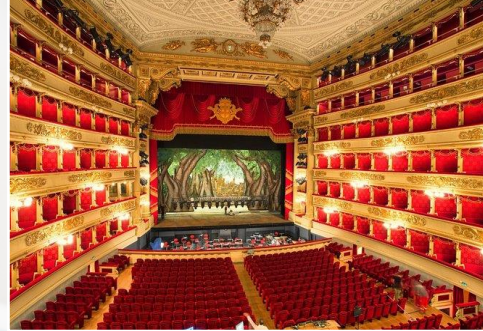
Milan's La Scala Opera House