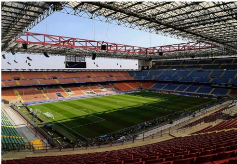
San Siro Stadium (Stadio San Siro) Milan