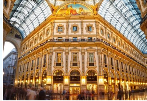
Galleria Vittorio Emmanuelle II: Luxury Shops and Elegant Cafés