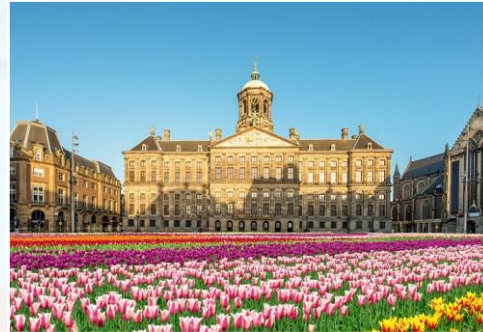
Royal Palace of Amsterdam