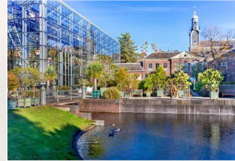
The Botanical Gardens