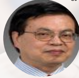
Long-Fu Xi Department of Epidemiology University of Washington USA