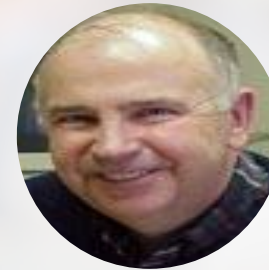
James J. Collins School of Health Sciences Saginaw Valley State University Bay City