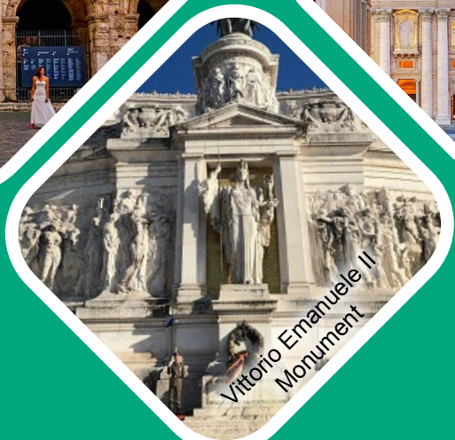
Vittorio Emanuele II Monument