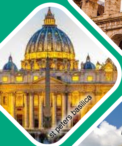
st peters basilica