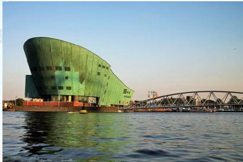
NEMO Science Museum