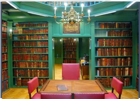
Jewish historical meuseum