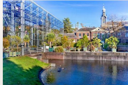
The botonical gardens