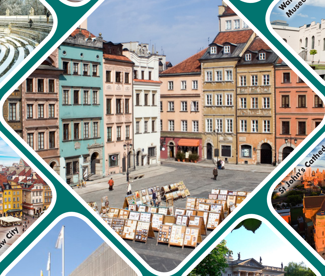
Warsaw Rising Museum