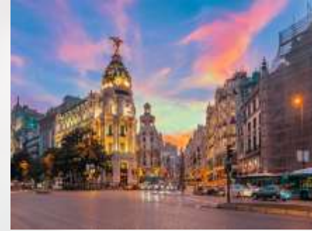
The Culture Trip