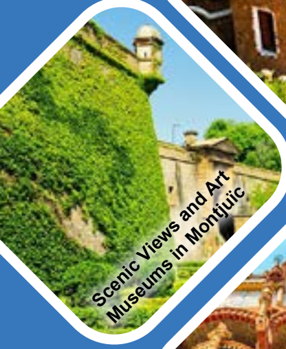
Scenic Views and Art Museums in Montjuïc