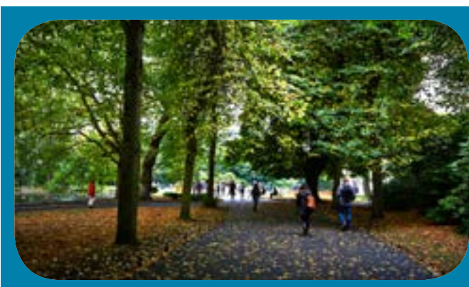
St Stephens Green