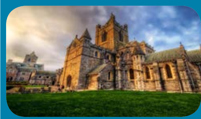
Christ Church Cathedral