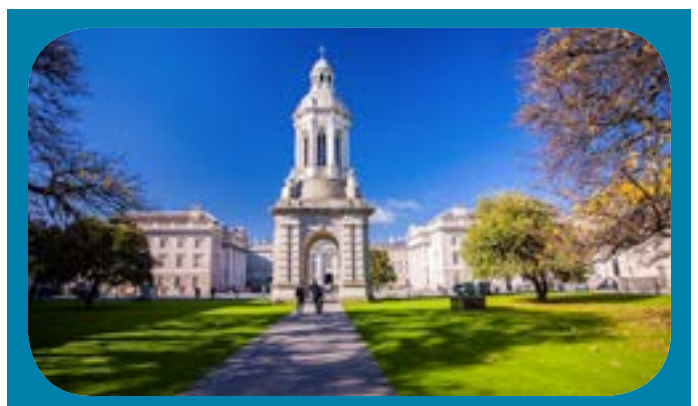
Trinity College and College Green