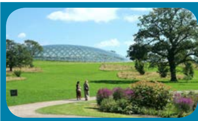
National Botanic Gardens