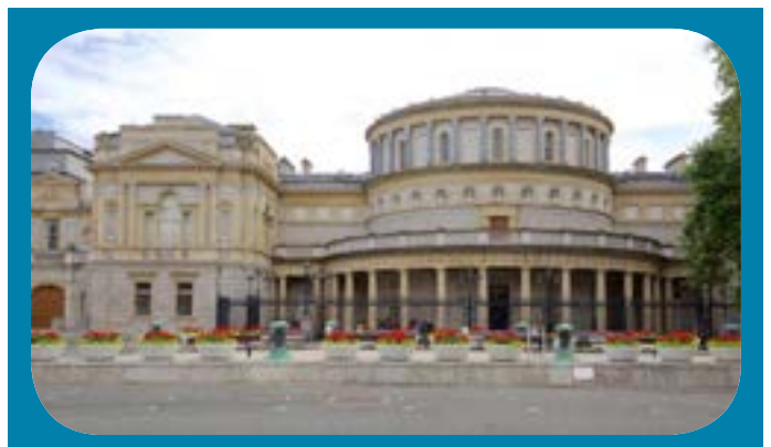
National Museum Ireland