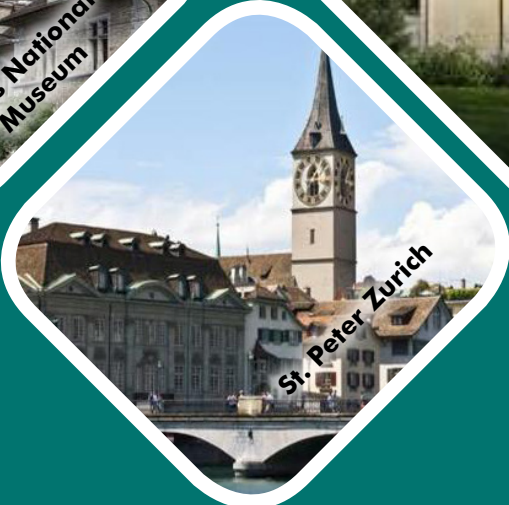
St. Peter Zurich