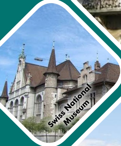
Swiss National Museum