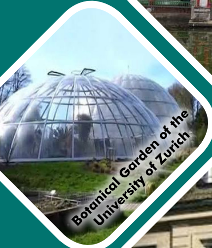
Botanical Garden of the University of Zurich