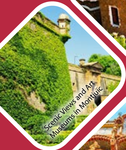
Scenic Views and Art Museums in Montjuïc