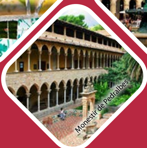
Monestir de Pedralbes