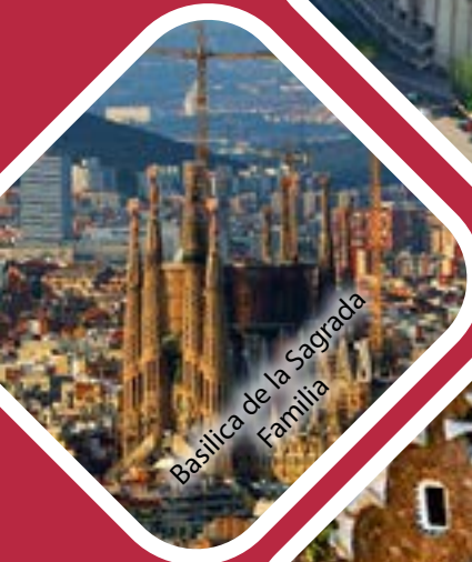
Basilica de la Sagrada Família