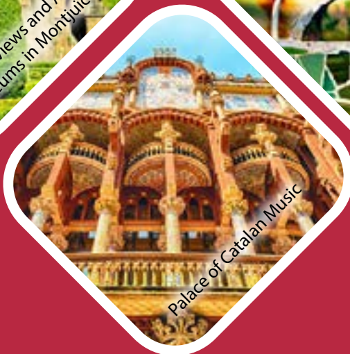
Palace of Catalan Music