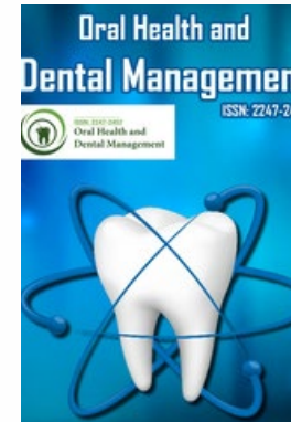
Oral Health and Dental Management