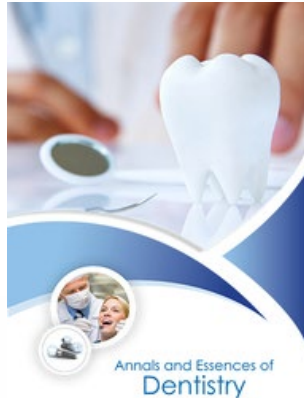
Annals and Essences of Dentistry