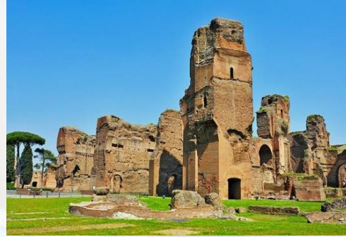
Bath of Caracalla