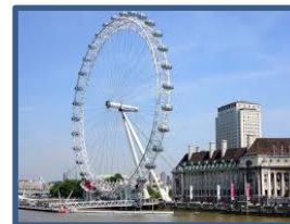
The London Eye