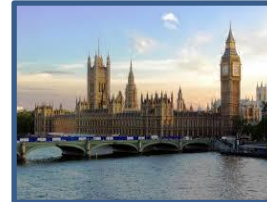
Palace of Westminster