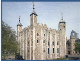
HM Tower of London