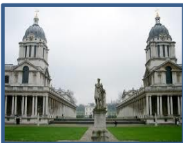
Royal Museums Greenwich