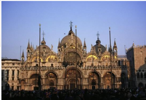
St. Mark's Basilica