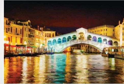
Ponte di Rialto (Rialto Bridge) and San Polo