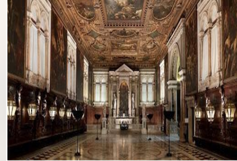
Scuola Grande di San Rocco