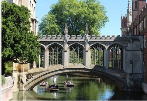
Bridge of Sighs