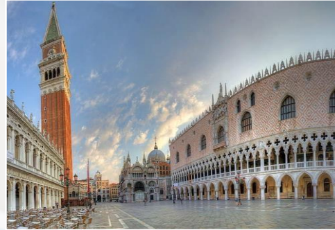
Piazza San Marco