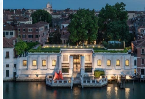
Peggy Guggenheim Collection