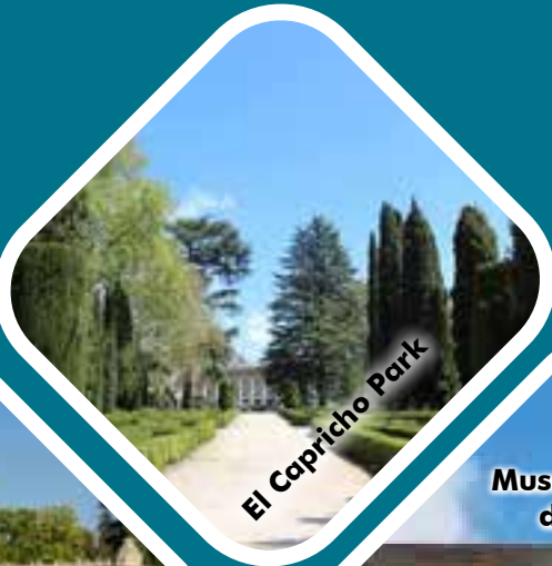
El Capricho Park