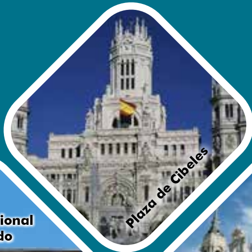
Plaza de Cibeles