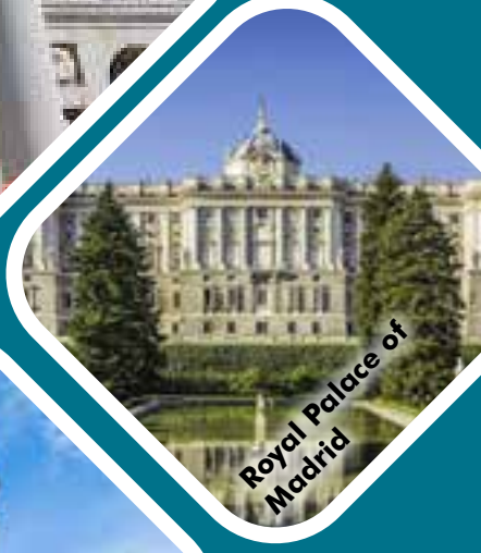
Royal Palace of Madrid