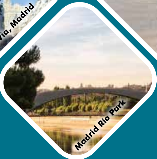
Madrid Río Park