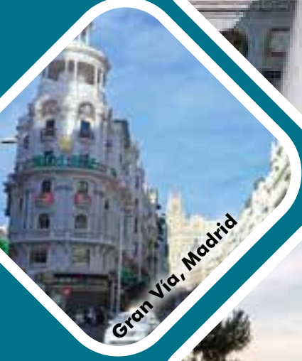
Gran Vía, Madrid