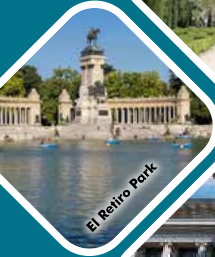
El Retiro Park