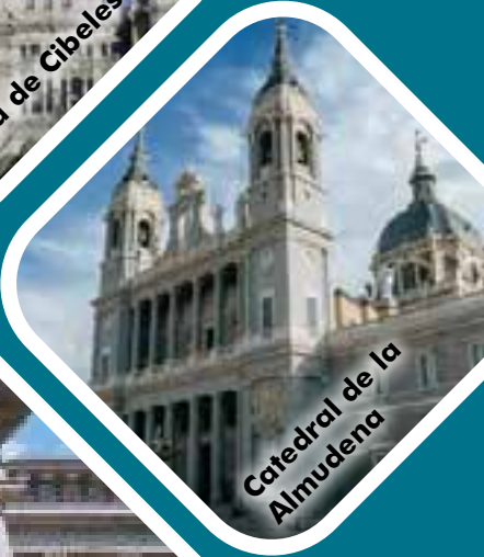
Catedral de la Almudena