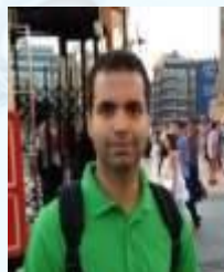
George Papadakis Metaxa Anticancer Hospital Greece