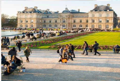
Jardin du Luxembourg