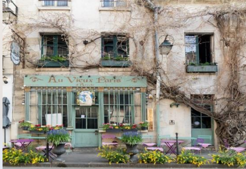
Au Vieux Paris d'Arcole