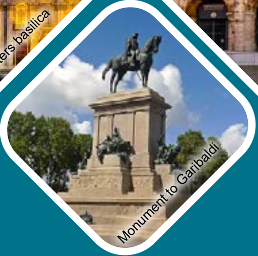
Monument to Garibaldi