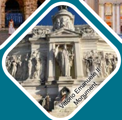
Vittorio Emanuele II Monument