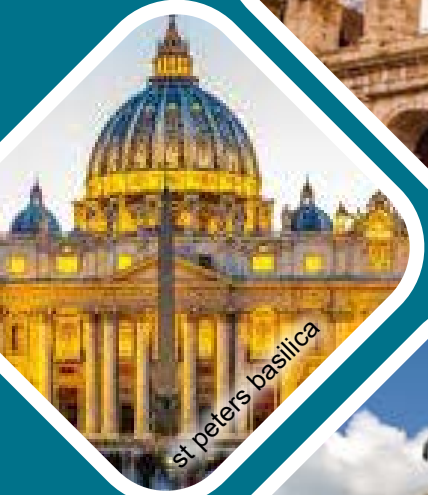
st peters basilica