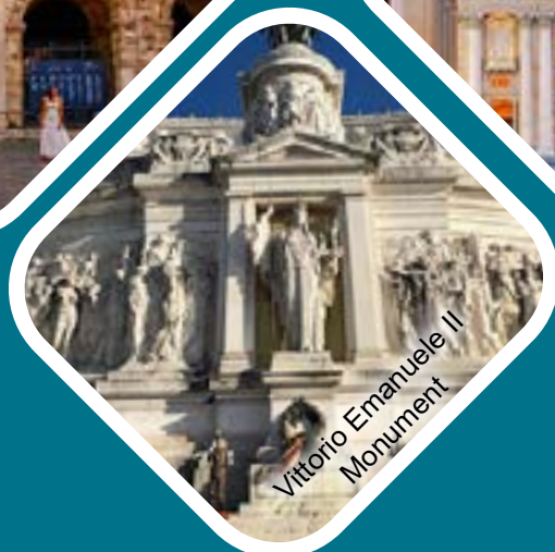
Vittorio Emanuele II Monument