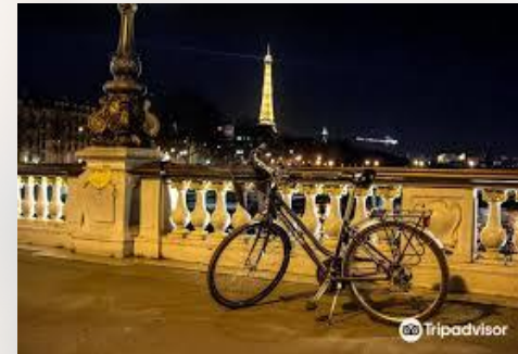
Paris Night Bike Place