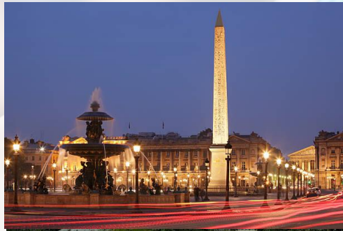
Olace de la concorde