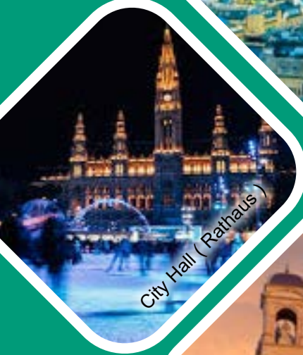
City Hall (Rathaus)