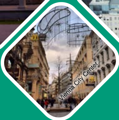
Vienna City Center