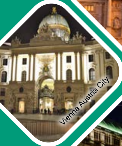
Vienna Austria City