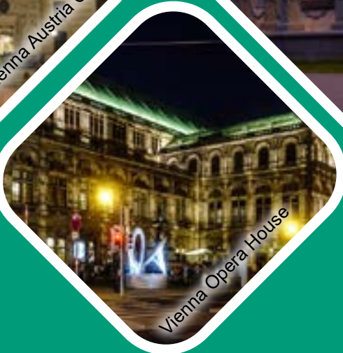
Vienna Opera House