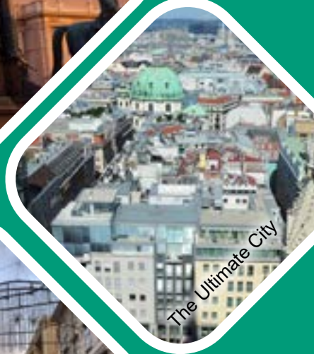
The Ultimate City