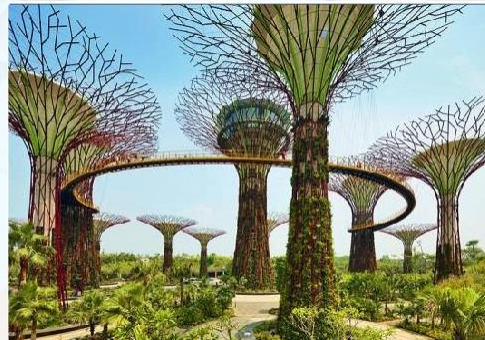
Gardens by the Bay