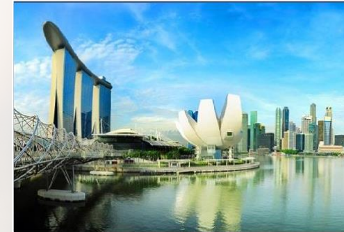
Marina Bay Sands