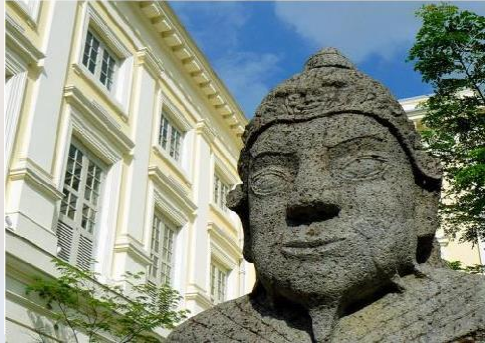
Asian Civilizations Museum