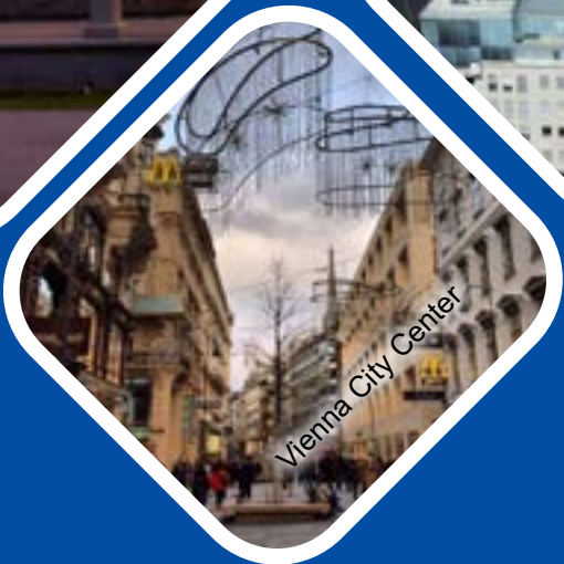
Vienna City Center