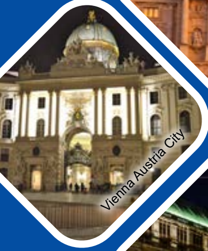
Vienna Austria City