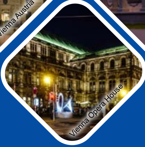
Vienna Opera House