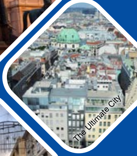
The Ultimate City