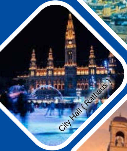
City Hall (Rathaus)