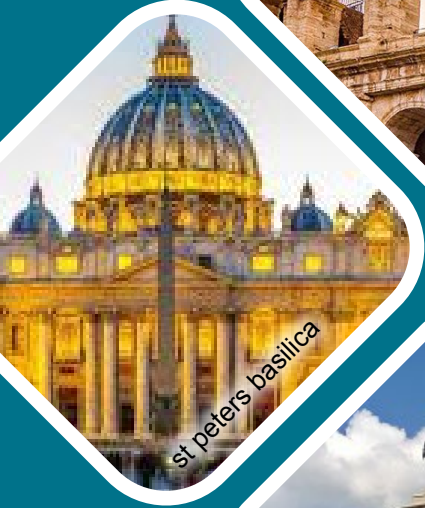
st peters basilica