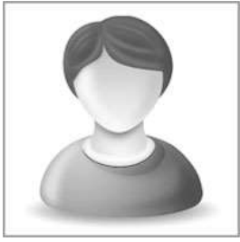
Official HD Photo