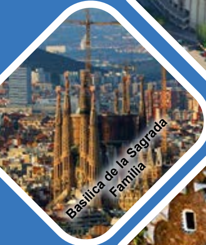
Basilica de la Sagrada Família