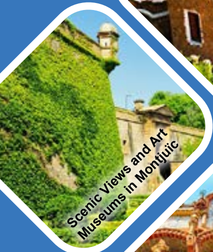
Scenic Views and Art Museums in Montjuïc