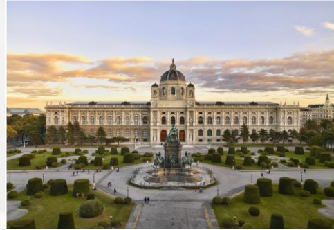
Kunsthistorisches Museum Vienna