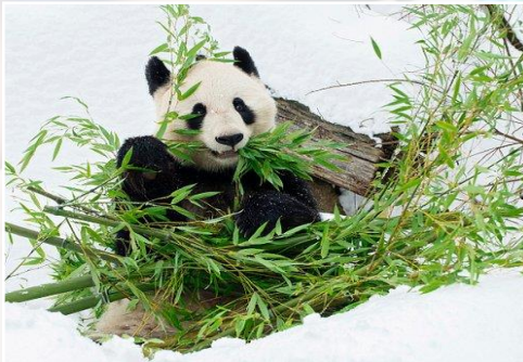
Tiergarten Schönbrunn - Zoo Vienna