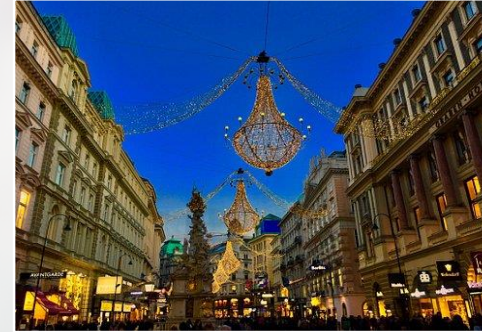
Historic Center of Vienna