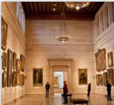
Boston's Museum of Science