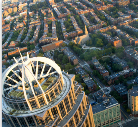
Top of the Hub