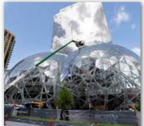
Franklin Park Zoo