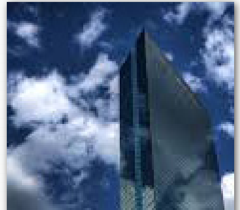
John Hancock Tower