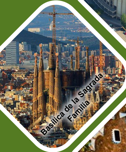
Basilica de la Sagrada Família