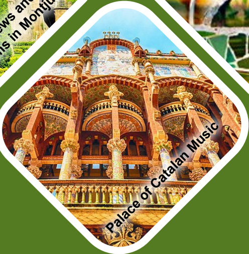
Palace of Catalan Music