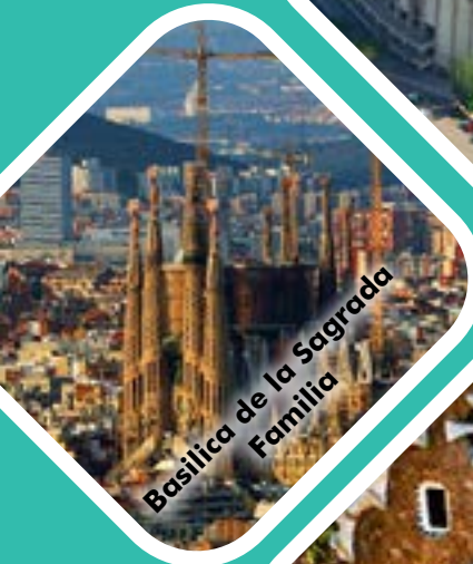
Basilica de la Sagrada Família