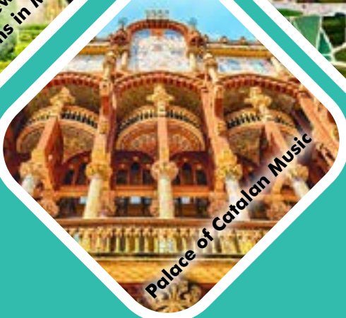
Palace of Catalan Music