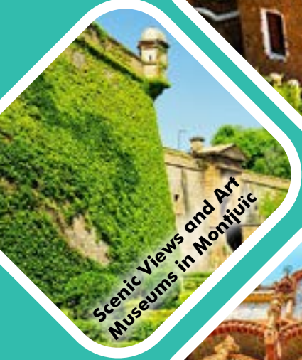
Scenic Views and Art Museums in Montjuïc