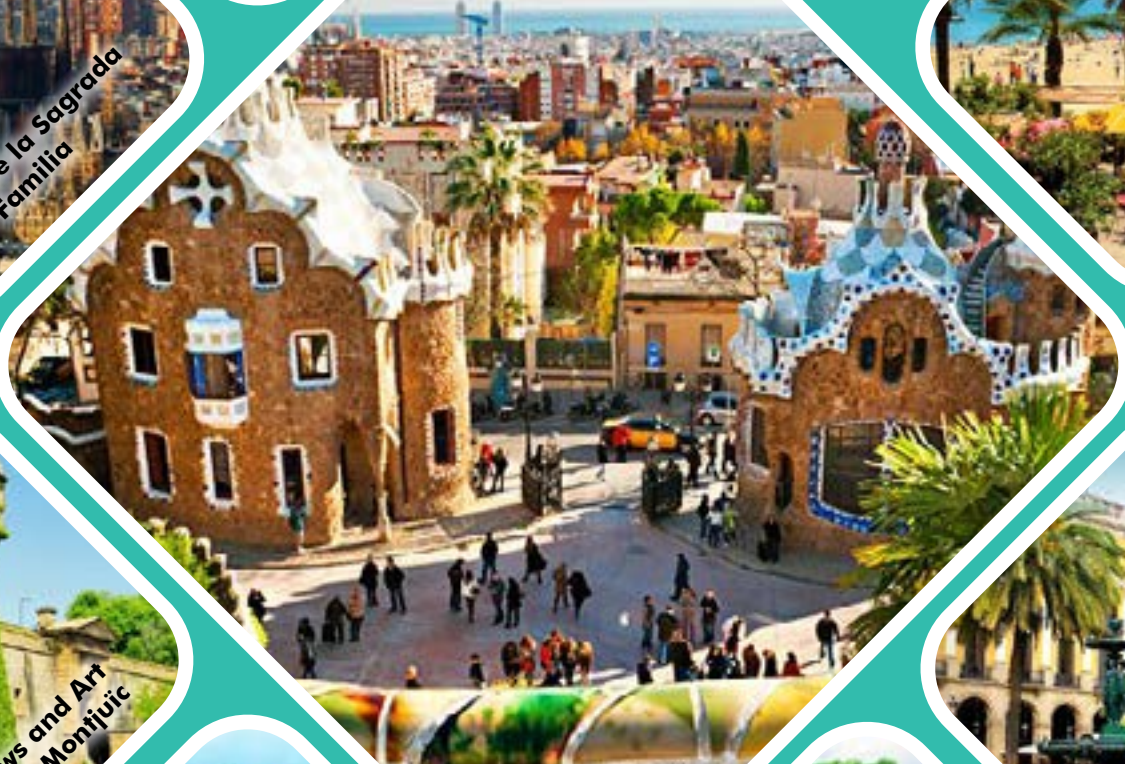
Gaudí's Surrealist Park