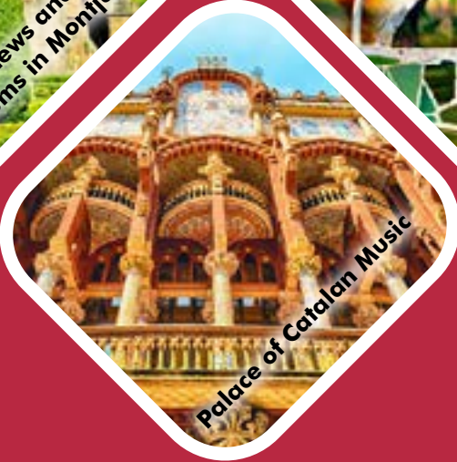
Palace of Catalan Music