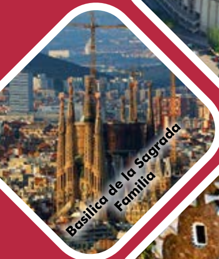
Basilica de la Sagrada Família