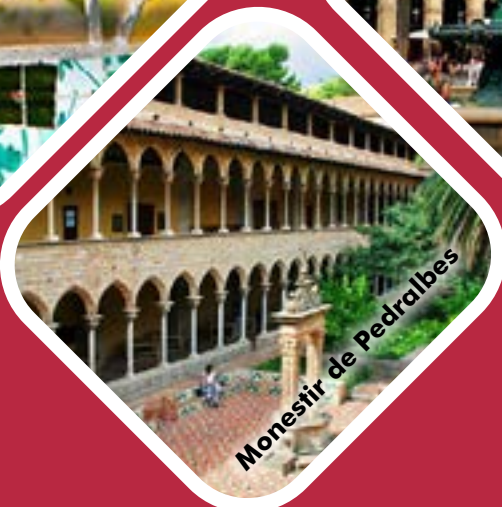
Monestir de Pedralbes