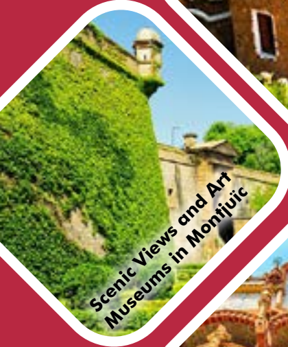
Scenic Views and Art Museums in Montjuïc