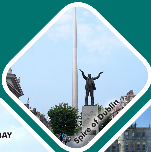
Spire of Dublin