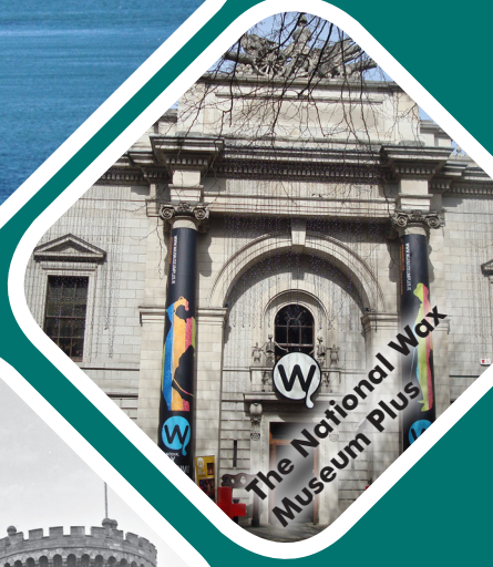
The National Wax Museum Plus