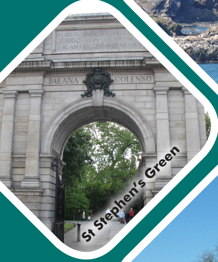
St Stephen's Green