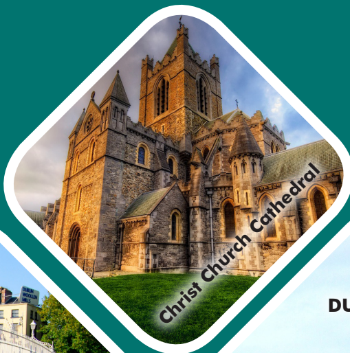
Christ Church Cathedral